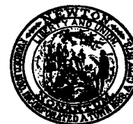
Setti D. Warren Mayor

1164 Centre Street, Newton Center, MA 02459-1584 Chief: (617) 796-2210 Fire Prevention: (617) 796-2230 FAX: (617) 796-2211 EMERGENCY: 911